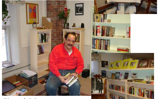
Picture 2 & Insets